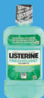
6-8.5 oz. btls. Listerine Mouthwash