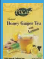
1-20 ct. pkg. Pocas Tea Bags