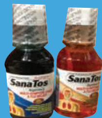
6-6 oz. pkgs. Daytime or Nighttime SanaTos Cold Flu Relief