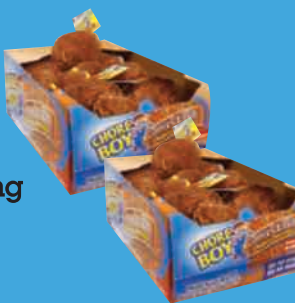
1-36 ct. pkg. Chore Boy Copper Scrubbers