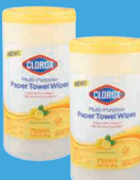
6-75 ct. ctns. Clorox Multi- Purpose Wipes