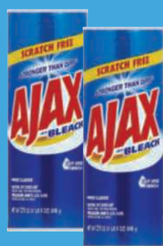
12-21 oz. ctns. Ajax Cleaner with Bleach