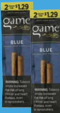
30-2 ct. pkgs. 2/$1.29 Game Natural Leaf Cigars