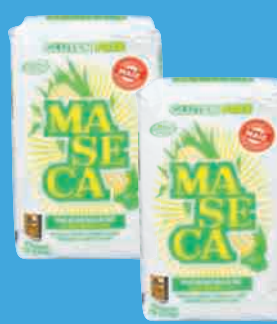
1-22 lb. bag Maseca Traditional Corn Flour