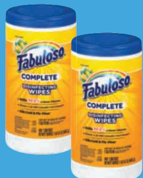
1-24 ct. ctns. Lemon Fabuloso Wipes