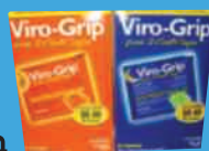
1-24 ct. pkg. AM or PM Viro-Grip Lemon Tea