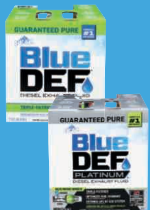
1-2.5 gal. ctn. Blue Def Diesel Exhaust Fluid