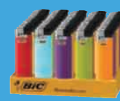
1-50 ct. pkg. Maxi BiC Lighters