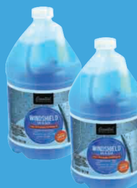
6-1 gal. jugs Essential Everyday Windshield Wash