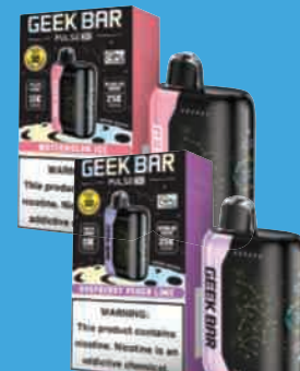
1-5 ct. Geek Bar PulseX