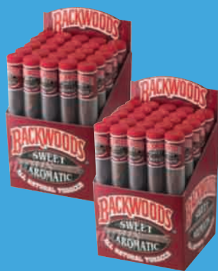
1-24 ct. pkg. Singles Backwoods Cigars