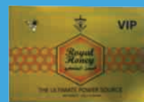
1-12 ct. pkg. Golden Royal Honey