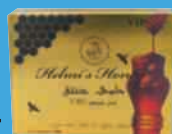
1-24 ct. pkg. Helmi's Honey VIP