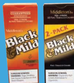
1-25 ct. pkg. Plastic Tip Black & Mild Cigars