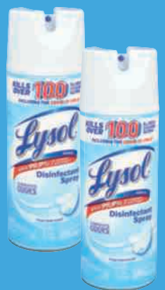
12-12.5 oz. ctn. Lysol Disinfectant Spray