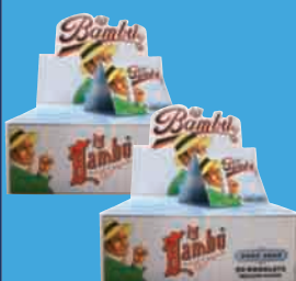
1-50 ct. box Pure Hemp Big Bambu Rolling Papers AS AVAILABLE