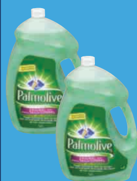
1-5 ltr. btl. Palmolive Dish Detergent