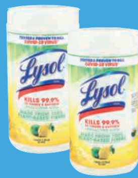
4/84 ct. pkgs. Citrus Lysol Disinfecting Wipes