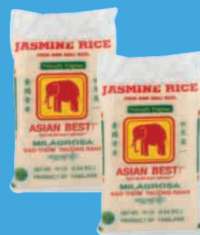
1-25 lb. bag Asian Best Jasmine Rice