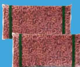
1-50 lb. bag Saco de Frijol Rojo