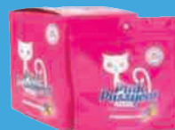
5-12 ct. pkgs. Pink Pussycat