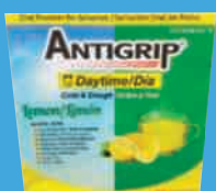
1-18 ct. pkg. Daytime or Nighttime Antigrip Tea