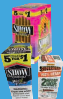
1-15 ct. box 5/$1.00 Show Cigars