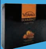
1-10 ct. pkg. Vitamax Doubleshot Energy Honey